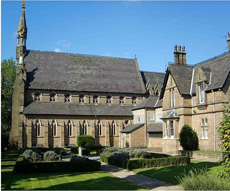
All Saints, Barton, Grade I