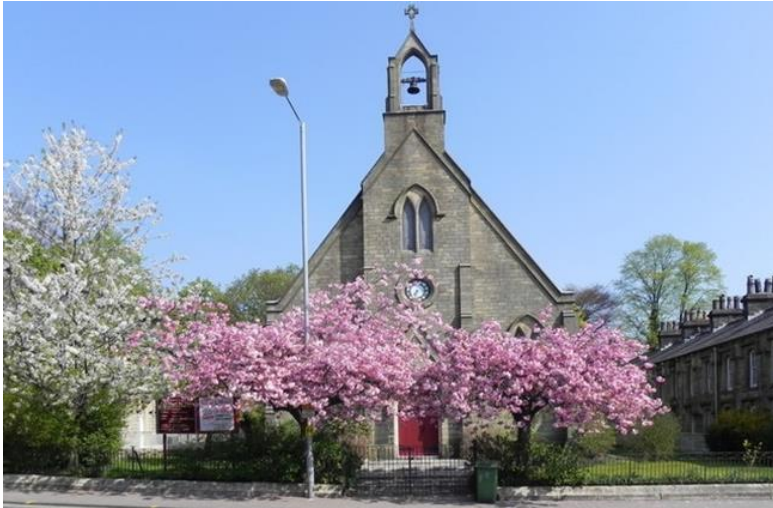
St Paul's Church, Halliwell – Grade II