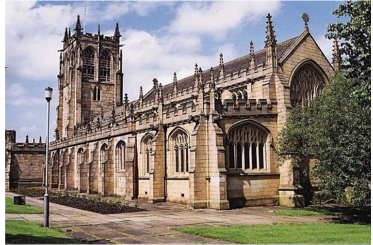
St Chad's Church, Rochdale – Grade II*