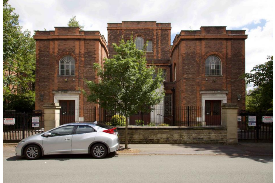
Shaare Rachamim Synagogue, Grade II