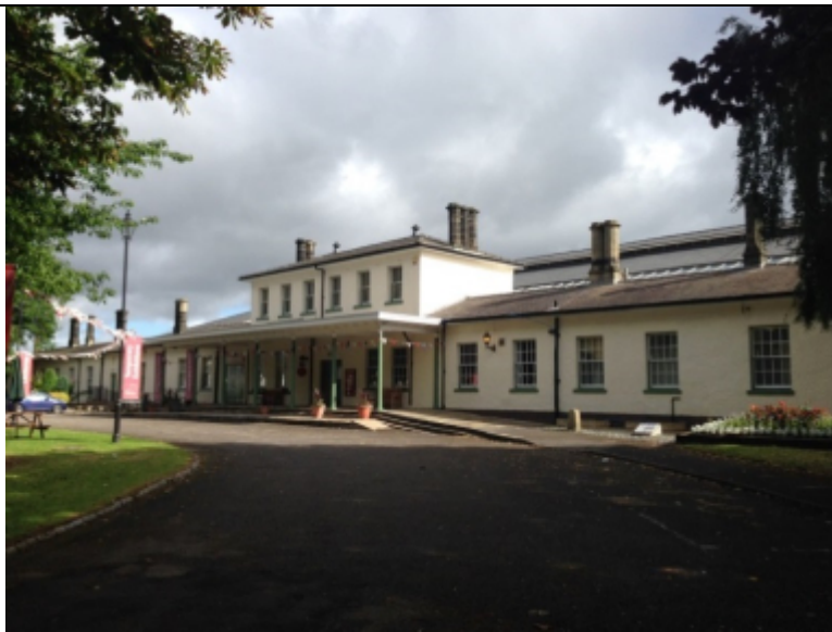
North Station Road, Darlington