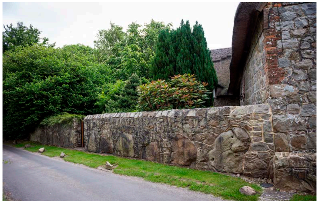
Figure 18: Building and garden walls, East Kennet. Sarsen stone.

The building of the Kennet and Avon Canal enabled the stones to be carried further afield. Marlborough and the villages of the Kennet Valley are where Sarsen stones have been most widely used in the buildings, which is a reflection of their former abundance in this area.