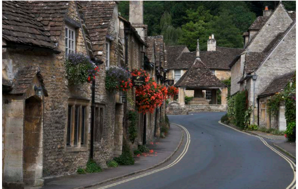
Figure 2: Castle Combe. Bath Stone and limestone roof tiles.

they were used extensively in Bath. During the Anglo-Saxon period, Bath Stone was employed over a surprisingly large area, at the 7th-century St Laurence Church in Bradford on Avon, for example, continuing through the Middle Ages at Malmesbury Abbey, Lacock Abbey, Monkton Farleigh Priory, Great Chalfield Manor and Longleat House.