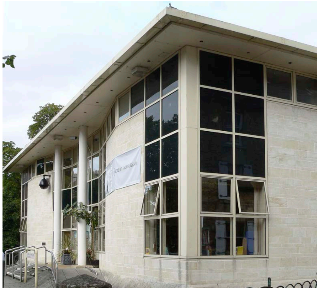
Figure 5: Library, Bradford on Avon. Bath Oolite.

Any irregularities or cracks ruin the stone for top quality building, thereby reducing its value. The stone is soft and easy to work when first quarried. It is traditionally kept underground until May, because the freshly quarried stone can be damaged by frost (due to its high water content). It is then seasoned on the surface through the summer, where it dries out naturally. However, the huge demand for stone in the 19th century often resulted in unseasoned stone being used, with disastrous consequences. The stones must also be kept the right way up when building, with the bedding planes horizontal, otherwise fine layers will tend to flake off from the surface because weathering will pick out any weaknesses in the bedding.