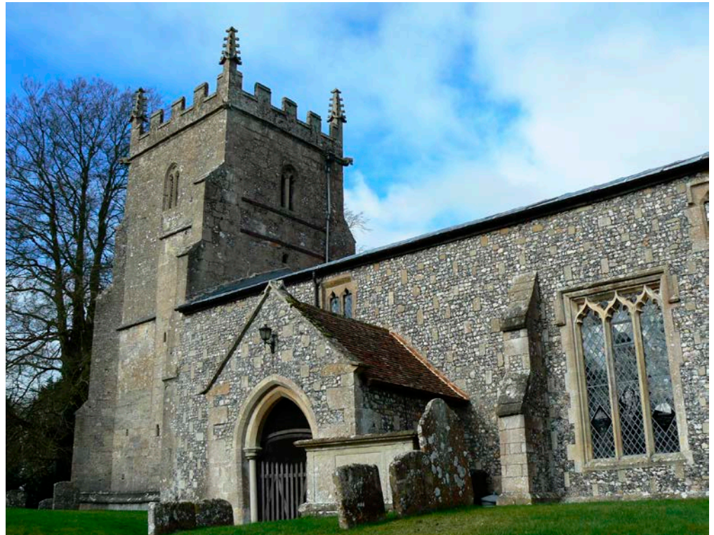
Figure 15: St Peter's Church, Milton Lilbourne. Flint and stone; Jurassic limestone tower.

as well with mortar as flints that have their porous white outer layer still intact. Stone or brick courses were often incorporated in a flint wall to give it extra strength. Limestone was used for carved window dressings, doorways, quoins and buttresses. Decorative effects were achieved by alternating flint with bricks or stone. This can be seen throughout eastern and southern Wiltshire, where a chequered pattern of flint and stone, characteristic of the chalk country, has been produced. Dressings are brick or limestone. This use of flint with limestone characterises the majority of church buildings in the chalk downlands.