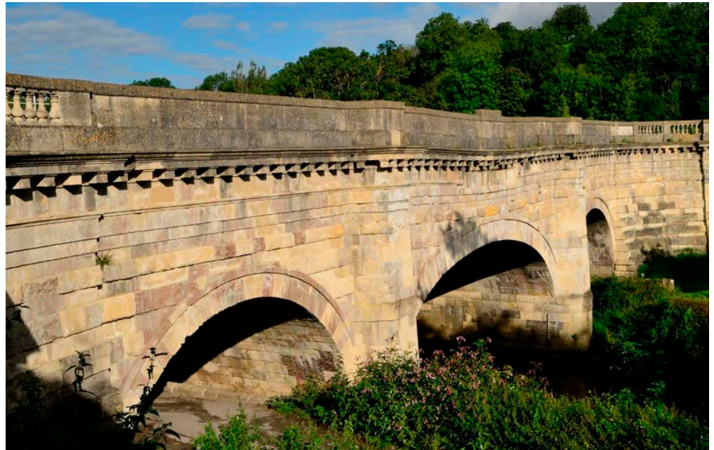
Figure 4: Avoncliff Aqueduct. Bath Stone.

The strength of Bath Stone comes from the crystalline (spar) calcite cement between the grains, rather than from the ooids. The cement prevents water being absorbed into the rock by the softer porous ooids. This cement is, in part, derived from carbonate leached from shell fragments mixed in with the ooids, which recrystallised after burial. Thus, it is no coincidence that the best weatherstone in the area, Box Ground (Combe Down Oolite), contains the highest proportion of shell debris. The same level was extensively worked in the hills around Bath, and it is still quarried there on Combe Down. It was probably these lower beds of the formation that gave Bath Stone its reputation.