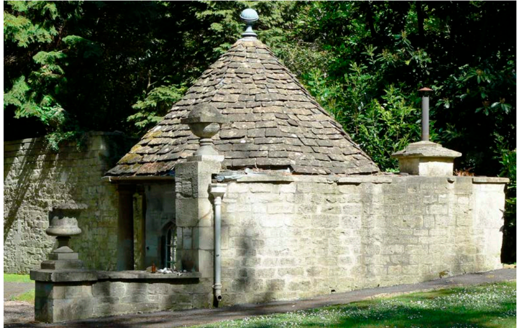
Figure 6: Garden building. Fissile ragstone roof slates.

They have been employed extensively for cottages, farm buildings and as a walling stone. Thinly bedded, fissile, shelly limestones provided the stone roof slates typical of the older Cotswold buildings, as well as cobbles and larger paving slabs. Small pits in fields around Bradford on Avon, Atworth, Gastard and Malmesbury were excavated for this purpose.