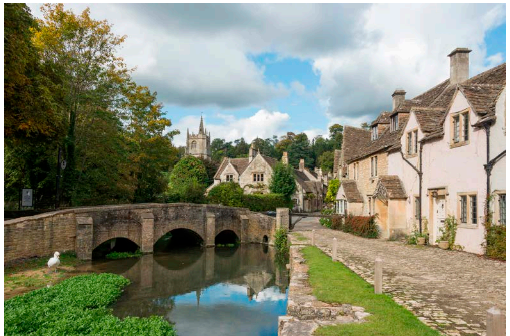
Figure 1: Castle Combe village. Local Jurassic limestone.

The character of a region is largely determined by its landscape and the local stones used to build its towns and villages. Generally, it is the harder limestones and sandstones that are used for building. The properties of the stone, colour, texture, bed thickness, durability, lateral extent and currently available technology for extraction and preparation, all determine which stones are used where. Transport has always been a major consideration because of the sheer weight and bulk of building stones. The advent of some 29 river navigation improvements during the 16th and 17th centuries, and the development of the railways in the 19th century and subsequently roads, opened the way for more widespread transport of stone far from its source of origin. The local character of towns and villages has changed as non-local building materials were brought in and the old sources neglected. The use of local building stone has significantly declined in Wiltshire in the past 100 years, mainly due to the easy availability of cheaper alternative building materials.