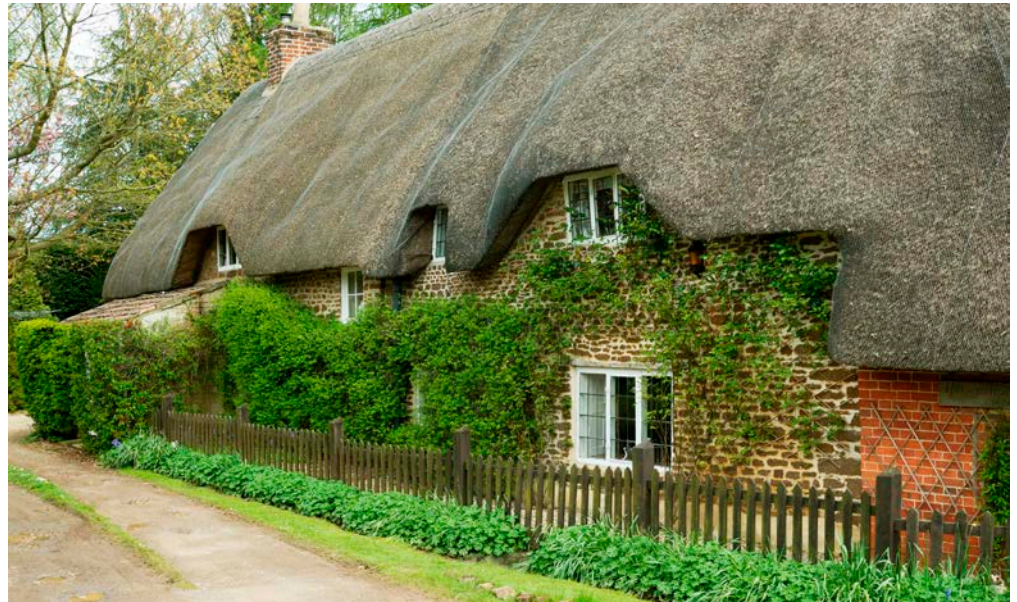
Figure 12: Thatched cottages, Sandy Lane. Lower Greensand Stone.

The Lower Greensand stone has only been used locally as a building stone, where natural cementation by iron oxide has rendered it sufficiently durable. The area around Sandy Lane, south-west of Calne, had quarries that provided the dark orange-brown sandstone for the cottages in the village.