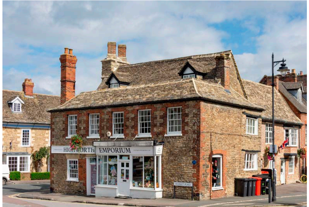
Figure 9: High Street, Highworth. Calne Stone.

Freestones are exceptional in this group, however, and the Corallian limestone areas typically show a variety of hardstone blocks and rubblestone in the buildings. The wide variety of textures and tones of cream, grey and brown imparts a particular charm to the villages and towns along its outcrop, including at Highworth and Wootton Bassett. Dressings are often of local brick or freestone, as can be seen at Highworth. The Coral Rag Formation is a fine-grained, coralline, rubbly limestone, formed around the reefs as detrital build-ups. It can make good quality, durable, building stone.