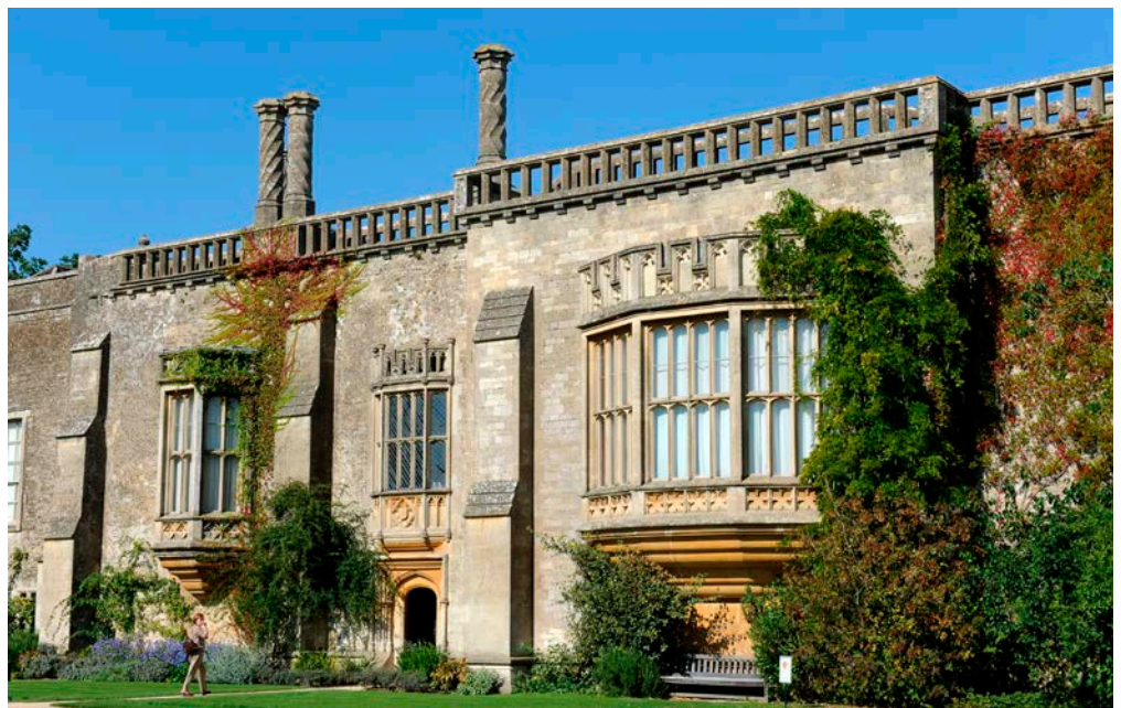
Figure 3: Lacock Abbey, Lacock. Bath Stone.

However, the golden age of Bath Stone was the 18th century, when it was used in the building of the city of Bath as a fashionable resort. The stone was originally cut from surface quarries, but, as the best quality beds are usually only a few metres thick, it soon became necessary to follow them into the hillsides. Vast underground mine workings developed. Along the route of the Kennet and Avon Canal, steep tramways linked the quarries high on the Avon Valley sides with the canal at Avoncliff, Murhill and Conkwell. Murhill Quarry opened in 1803 to supply stone for constructing the Kennet and Avon Canal. It was not an ideal choice, because the limestone could not withstand the constant dampness from the leakage of water from the canal, exemplified by