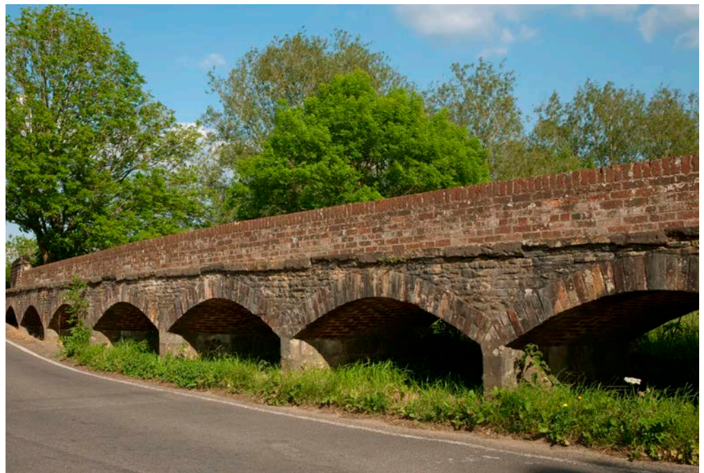
Figure 8: Maud Heath's Causeway. Kellaways Rock.

This is the lowest unit found in the Avon and Thames Valleys, which separate the Wiltshire Cotswold region from the chalk downlands. It contains a local building stone horizon at the top, known as the Kellaways Rock, which crops out north-east of Chippenham, around the village of Kellaways. Here, the hard calcareous sandstone, up to 4m in thickness, has been used to build Maud Heath's Causeway, a 15th-century footbridge over the floodplain.