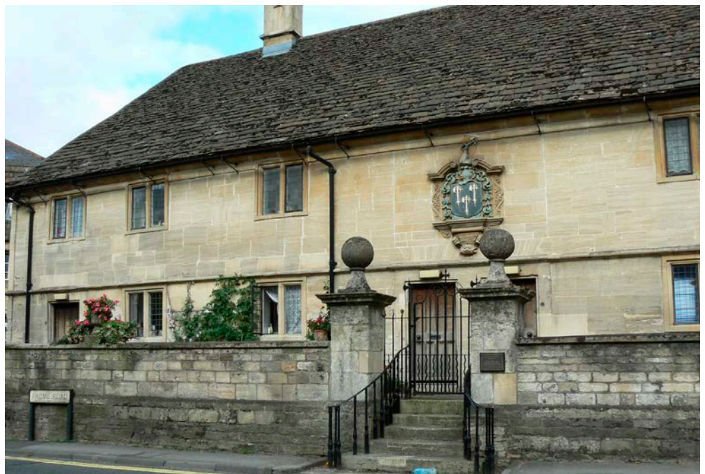
Figure 7: Hall's Almshouses, Bradford on Avon. Ancliff Oolite.

The freestone from the Bradford on Avon area, the Ancliff Oolite, occurs locally in the lower part of the Forest Marble. It is quite distinctive, characterised by strongly developed cross-bedding, with layers of well-sorted shell fragments that are picked out by weathering. It was widely used from the 18th to the 20th century in Bradford and Trowbridge, but it is no longer worked. Hall's Almshouses in Bradford on Avon are constructed of Ancliff Oolite.