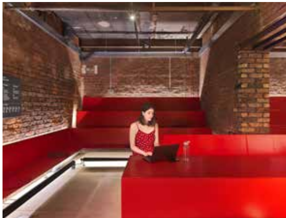
Brierfield Mill images