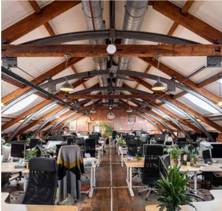
Beehive Mill: Top image Bottom image