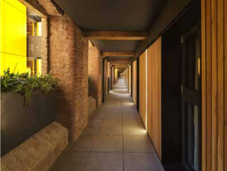
Crusader Mill images

There have been multiple exemplars across the north which have showcased the potential for repurposed mills since the 2016 and 2017 Engines of Prosperity studies, examples of which are provided here.