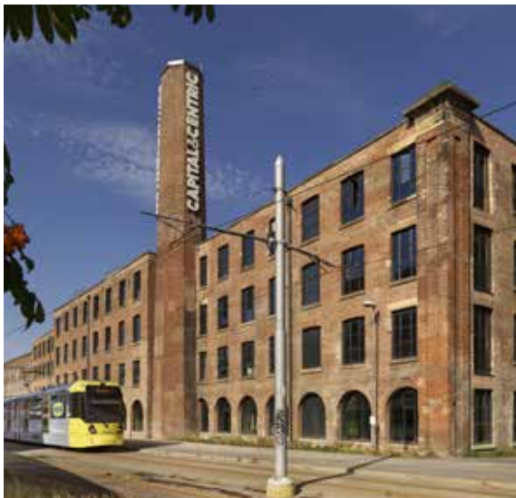
Conditioning House images