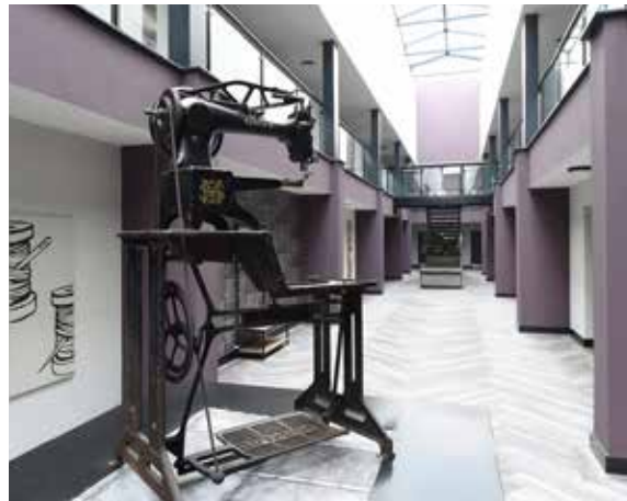
Hunslet Mill images