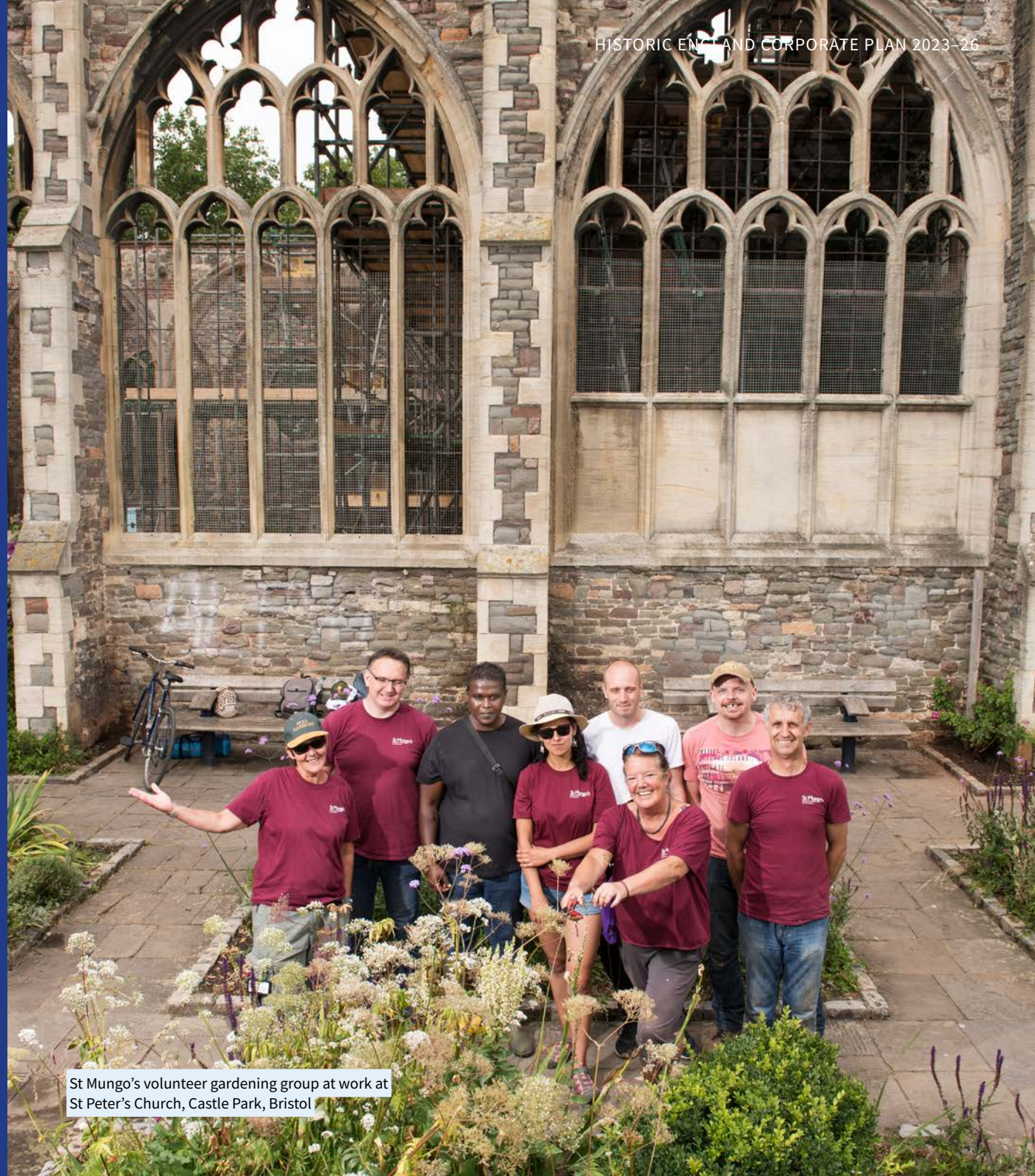
St Mungo's volunteer gardening group at work at St Peter's Church, Castle Park, Bristol