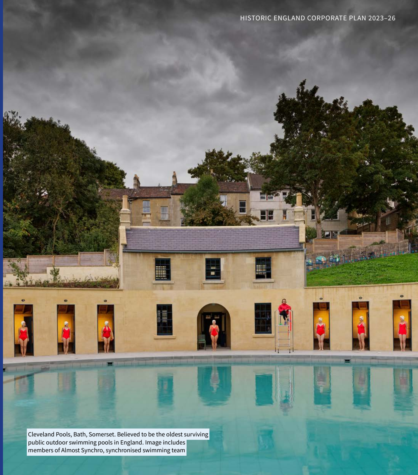
Cleveland Pools, Bath, Somerset. Believed to be the oldest surviving public outdoor swimming pools in England. Image includes members of Almost Synchro, synchronised swimming team

We will inspire and equip people to take action in support of the places they care about.