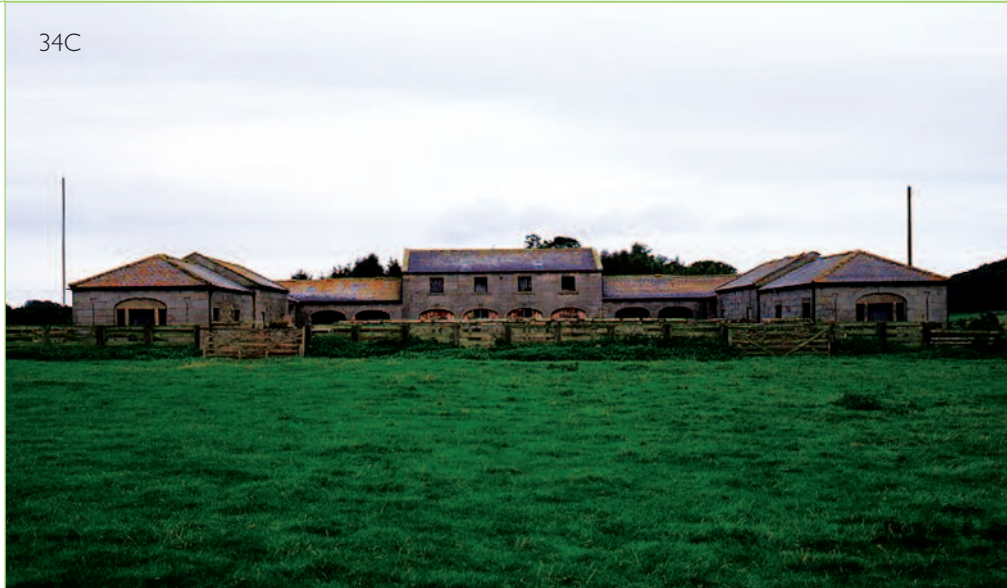
34C A large symmetrical building group in the park at Alnwick. The classical group of buildings are arranged in a U-plan around a yard open to the south. (Northumberland Sandstone Hills)

and wool into textiles, although evidence for mills or loom shops is very rare on surviving farms. Fuel for heating, in the form of timber or turf, would also be kept close to the house; specialist houses for peat, such as in Eskdale (Cumbria) are very rare. Some farmyards had recesses in the walls called bee boles to house a straw skep beehive. Occasionally a farm had its own slaughterhouse but many of these buildings do not have any characteristic external features, although internal features often included a higher ceiling and possibly a wheel to raise carcasses. Detached structures or rooms with chimneystacks served a diversity of functions: boil houses for animal (usually pig) feed; smithies (most frequently found on large farms, and located close to cart sheds); or washhouses. Farm dogs were often accommodated beneath the flights of steps